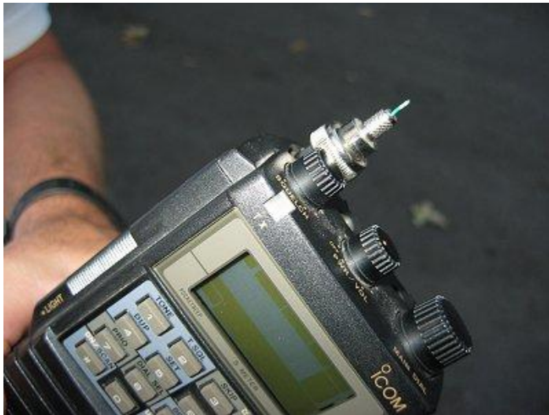
Photo 4: This is the "stubby antenna" used by Kyle, WQØG. It's a simple bit of wire inserted into the antenna connector on an HT. It's very effective for close-in work. If you can hear the fox with the wire removed from the antenna connector, you're very close -- be careful that the fox doesn't bite you!