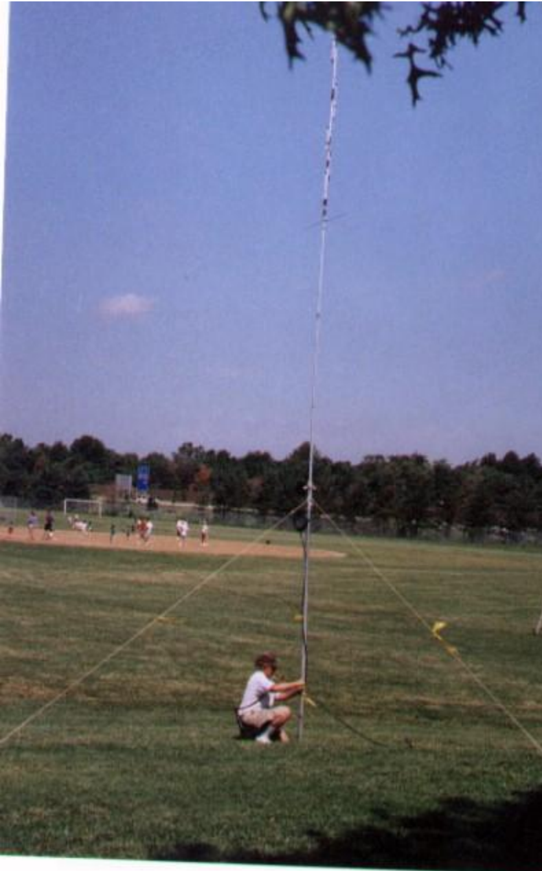
Photo 2: Terry KC0DHL does final preparation on our HF vertical antenna.