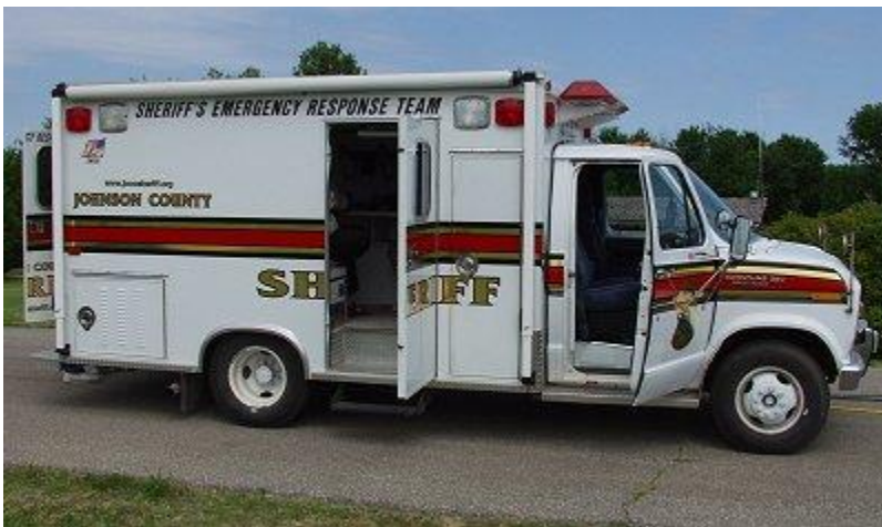
Photo 2: This year we had the Johnson County Kansas Sheriff's SERT (Sheriff's Emergency Response Team) vehicle on site. HF SSB and 6-meter operations were carried out within it. Along